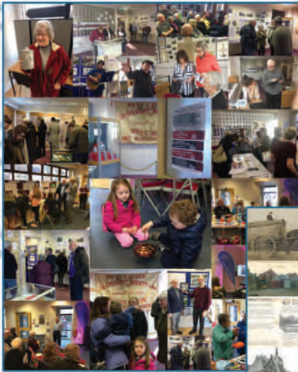
HERITAGE FESTIVAL & ENGAGEMENT 2018-2019