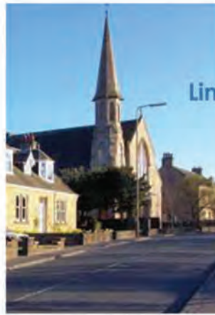
Limefield UF Church Limefield Road West Calder

IF YOU WOULD LIKE A PAGE IN THIS NEWSLETTER TO SHARE YOUR COMMUNITY GROUPS NEWS, JUST GET IN TOUCH WITH mhairi@westalder.org