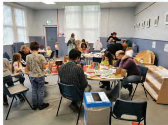
ACTIVITY WEEKEND CRAFTS & FACE PAINTING