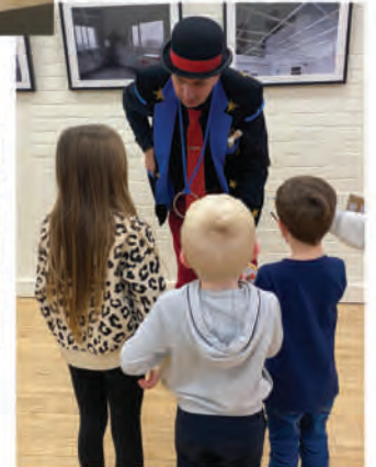
A LITTLE MAGIC FROM OUR WEEKEND