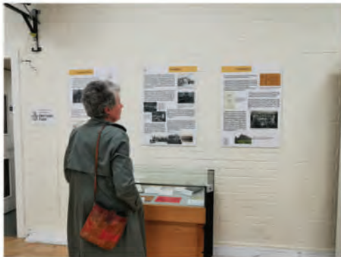
BAKERY BUILDING HERITAGE DISPLAY