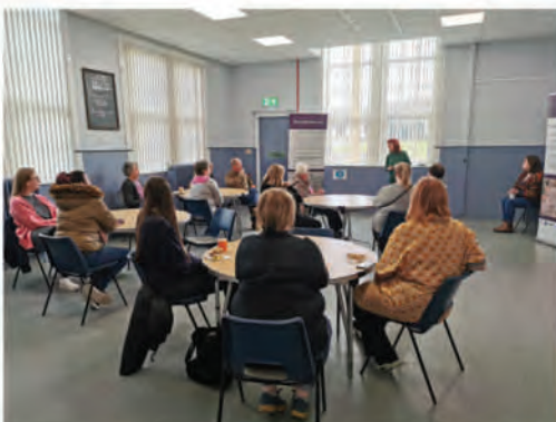
CREATIVE WRITING WORKSHOP INTRO