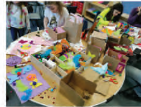
CRAFT MINI MUSEUM TASK FROM ACTIVITY WEEKEND