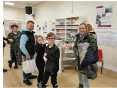
OUR 1950s REPLICA CO-OP SHOP