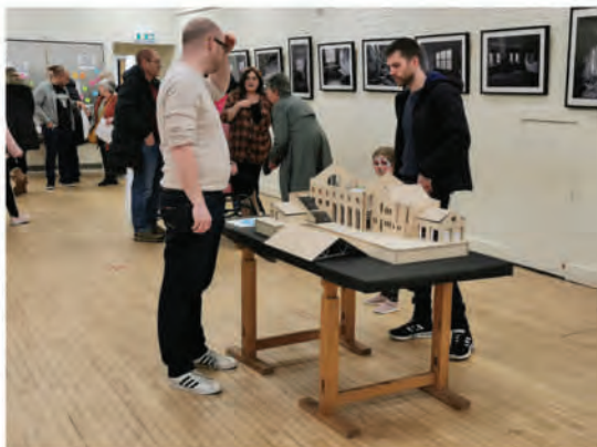
SCDC ARCHITECTS MODEL